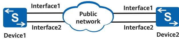
Figure 5-3 Eth-Trunk interface in LACP mode

As shown in Figure 5-3 , when no service is bound to the MA, an Eth-Trunk interface in LACP mode is configured on two devices. interface1 where the MEP resides is the interface of the Eth-Trunk interface's primary link. When the delay-measure two-way trigger if-down or loss-measure single-ended-synthetic trigger if-down command is configured on interface1, interface1 is triggered to go ETHOAM down if Y.1731 detects that the primary link has poor quality.